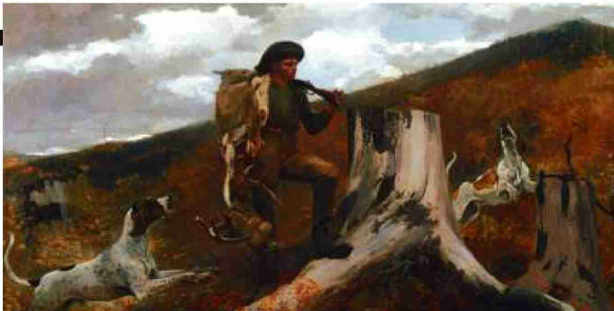
PEABODY ESSEX MUSEUM